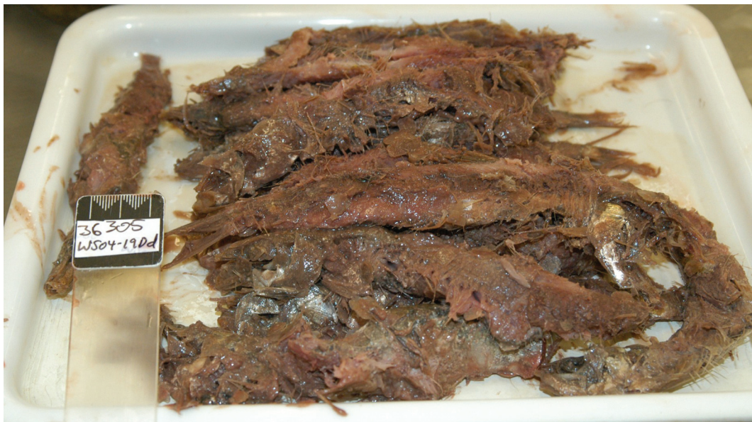
Fig. 3. Freshly ingested pilchard Sardinops neopilchardus extracted from the oesophagus and forestomach of Common Dolphin (WS04-19Dd). Note: This individual exhibited trauma indicative of net entanglement.

Of the 67 carcasses examined for parasites, 68.6% ( n=46 ) were reported to have some form of parasitism. Of these, 30.4% ( n=14 ) and 69.6% ( n=32 ) were males and females, respectively. Generally, parasites were more prevalent in mature animals, with the exception of lungworms, which were more frequent in immature individuals. Parasites were commonly found in the blubber ( Phyllobothrium delphini , Figure 4), under the serosa of the abdominal cavity ( Monorygma grimaldii ) and in the bronchi, bronchioles and parenchyma of the lungs ( Parafilaroides sp.). Round worm ( Crassicauda sp.) was occasionally detected in the subcutaneous tissue, particularly in the mammary duct of