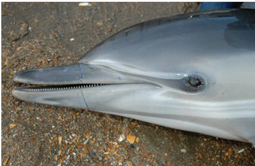
Fig. 1. A fresh juvenile Common Dolphin (KS05-25Dd) recovered from the Hauraki Gulf, Auckland. Note the fine linear lesions across the rostrum indicative of net entanglement within a monofilament gillnet.

stored in 70% ethanol for subsequent examination (Duignan et al. 2003).